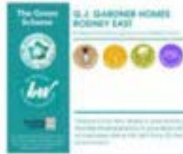
G. J. Gardner Residential