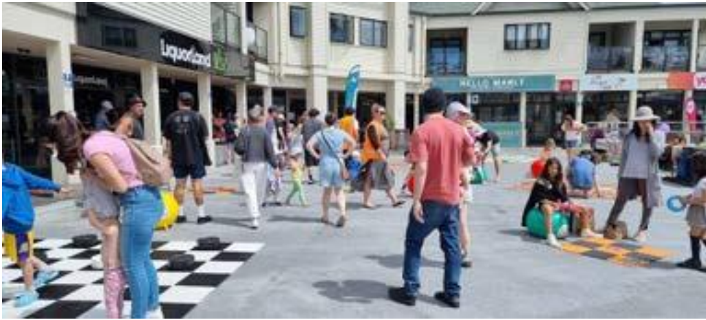
MANLY VILLAGE 4 NOVEMBER