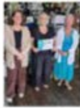
Brown Hair Salon